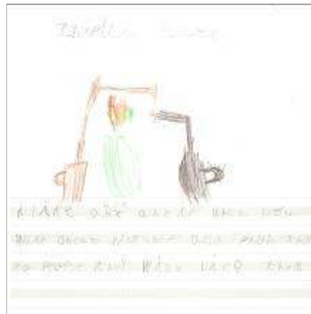
I like art. Art is when you make great pictures and show them to people. They will like them.—Tristin Ralston,