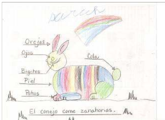
Spanish in Primary: Parts of the Rabbit