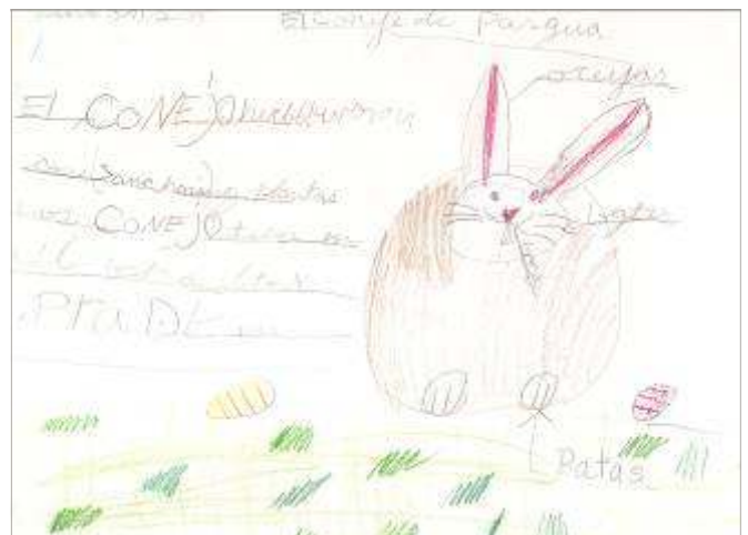
Spanish in Elementary: Parts of the Rabbit