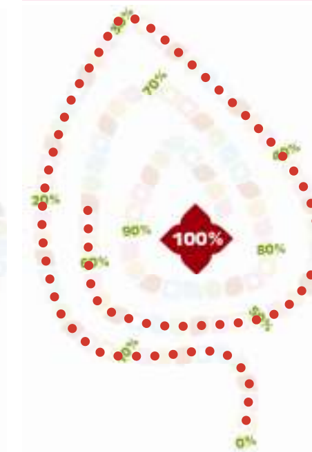
MIR Board participation: 63%