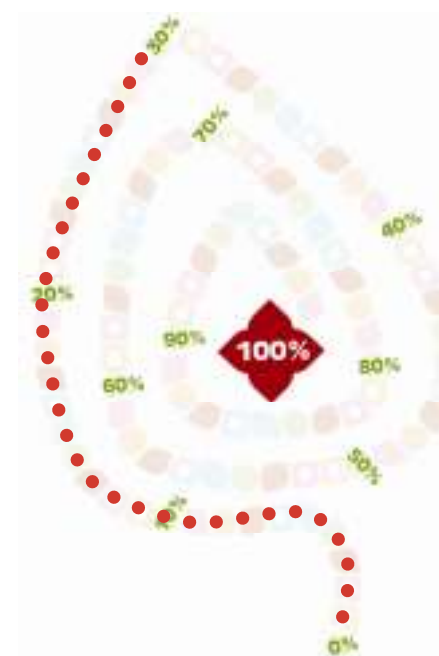
Schoolwide participation: 29%